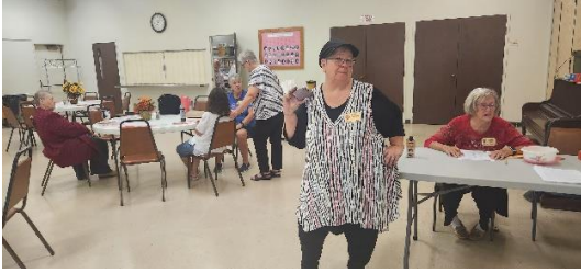
Mah Jongg pictures